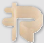
Molded Plastic Parts