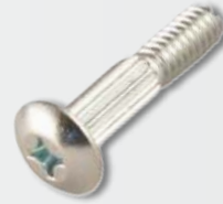
Ribbed Neck Screws