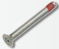
Screws with adhesive Patches