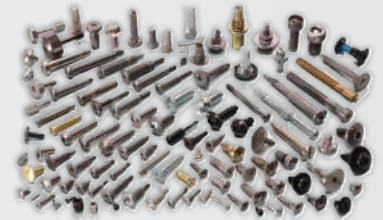
Screw Machined Products